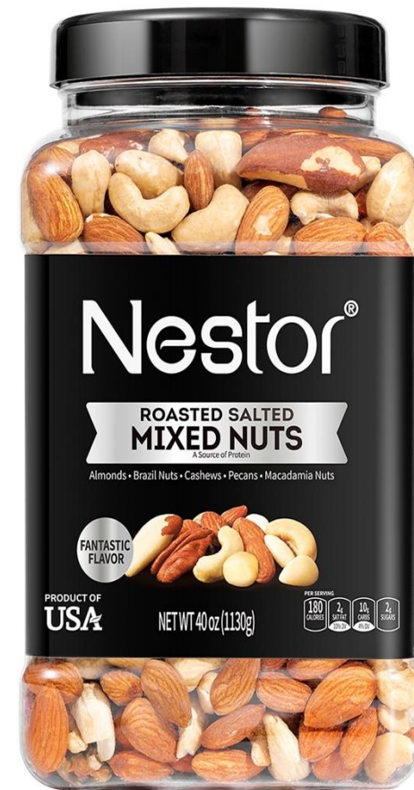
Salted Mix Nuts 1.13kg (6pcs/CTN)