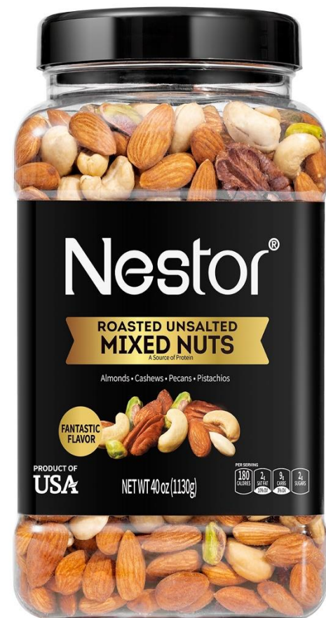
Unsalted Mix Nuts 1.13kg (6pcs/CTN)