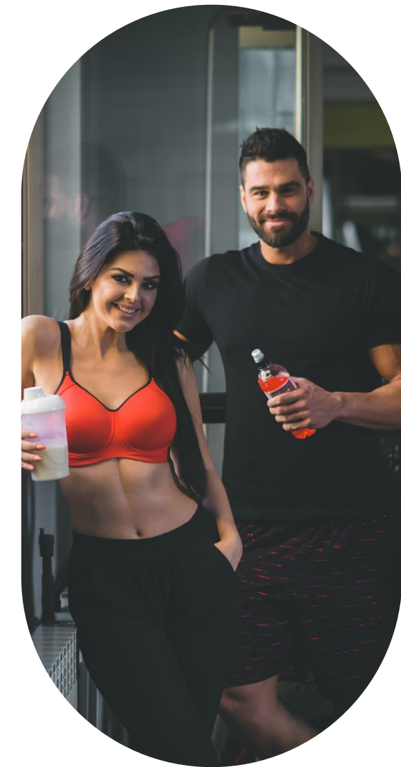
At the Gym